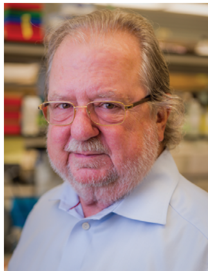
Figure 1. James P. Allison is the winner of the 2015 Lasker-DeBakey Clinical Medical Research Award for pioneering a new field of cancer immunotherapy. His achievements include elucidation of the structure of the T cell antigen receptor, elucidation of the function of CTLA-4, and the development of a CTLA-4-blocking antibody, which led to the development of therapeutic CTLA-4 antibodies (ipilimumab) that are now used to treat advanced melanoma.

T cells, except for the antigen-binding site of the TCR; thus, monoclonal antibodies specific for each clone would recognize the variable regions of the TCR. Indeed, biochemical analysis of the structures recognized by the clone-specific antibodies revealed the